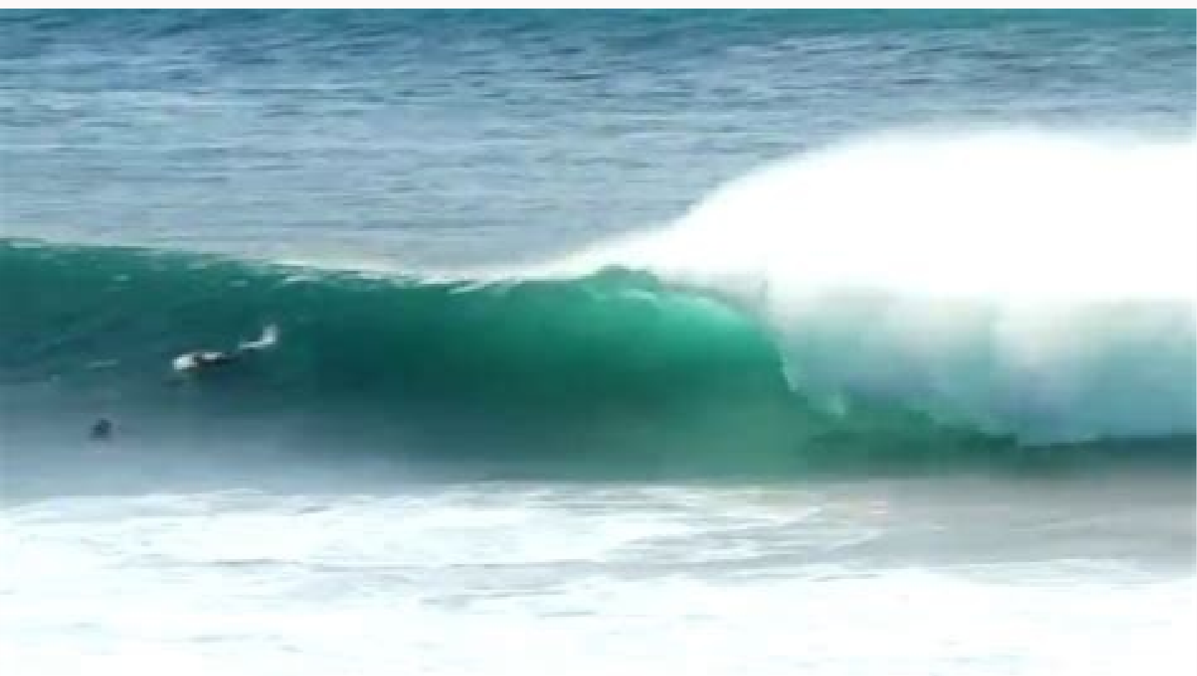
Fishing at holden beach surf report.